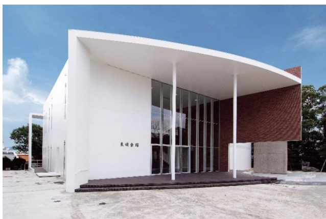
Ryoujun Hall, Nagasaki University School of Medicine