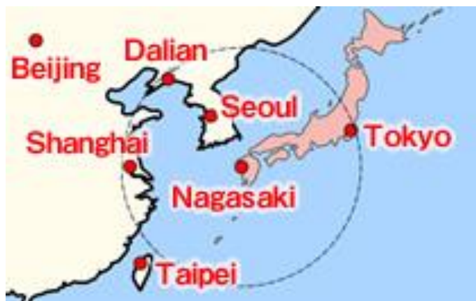
Location of Nagasaki City in East Asia